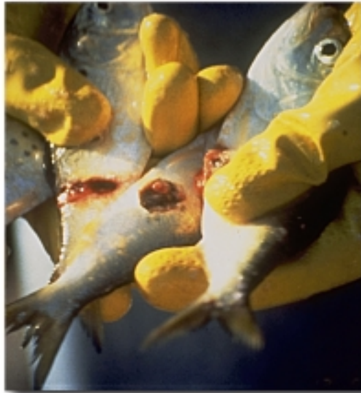
Some fish finished by pfiesteria.

presence of fish, pfiesteria transforms from an inactive cyst to a cyst that produces a poison. Pfiesteria uses this poison to stun fish, making it easier to