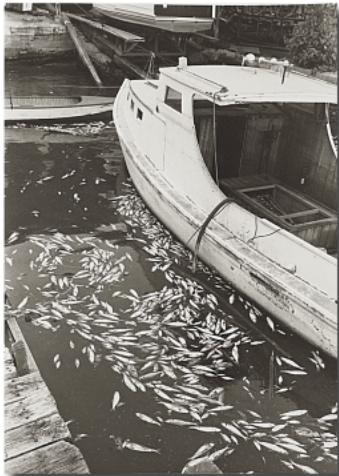
For a long time fish kills like this one along the east coast puzzled scientists. Eventually they discovered that a mysterious microorganism was causing the fish to die.

Although studies are being done to measure health risks, no one at this point can clearly define the risks. As a result of this uncertainty, officials suggest that we take precautions and use common sense. So, in other words, avoid swimming in areas known to be filled with dying fish. And don't eat or handle fish that have sores or look diseased. That shouldn't require too much convincing, should it?